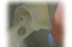
88SW & 88ESW