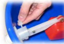
PW5, PW13, EF3 & 166386