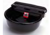
88SW & 88ESW