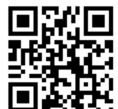
FW16 & FW16MTL