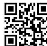
PW5, PW13, EF3 & 166386

http://www.youtube.com/user/millermfg1?feature=mhee