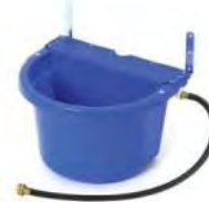
FW16 & FW16MTL